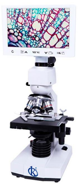
YR05785 Trinocular, 30°Inclined, USB Portable