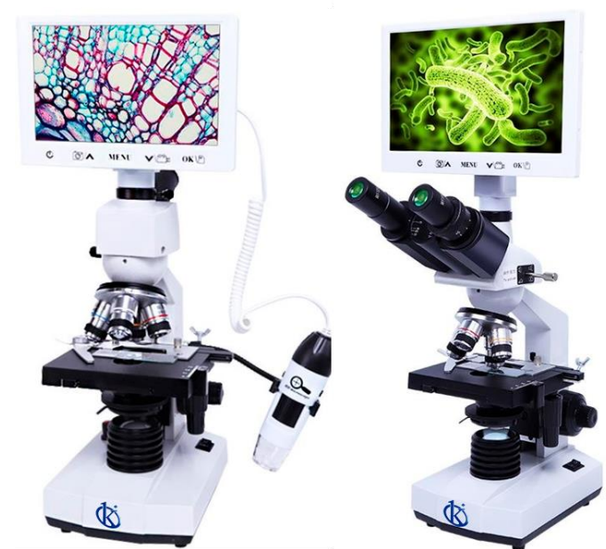
YR05786 Teaching Head 45°+90°Inclined