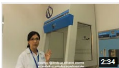
Kalstein France - Jacinto Convit Foundation / Alliances 23 views • 3 years ago