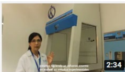
Kalstein France - Jacinto Convit Foundation / Alliances