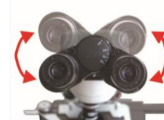
Comfortable observation with adjustable eyepoint height and interpupillary distance.