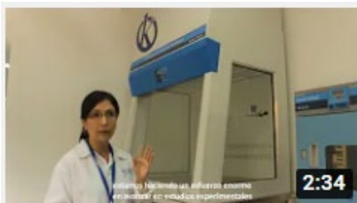
Kalstein France - Jacinto Convit Foundation / Allianc... 23 views • 3 years ago