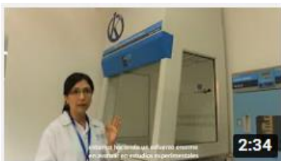
Kalstein France - Jacinto Convit Foundation / Alliances 23 views • 3 years ago