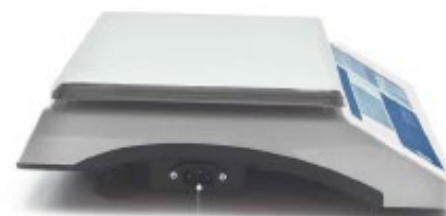
AC and DC