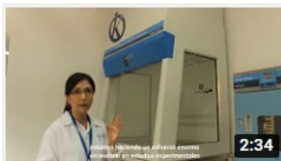
Kalstein France - Jacinto Convit Foundation / Alliances 23 views • 3 years ago