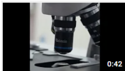
Kalstein's Microscopes 445 views • 1 week ago