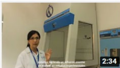
Kalstein France - Jacinto Convit Foundation / Alliances 23 views • 3 years ago