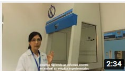
Kalstein France - Jacinto Convit Foundation / Alliances