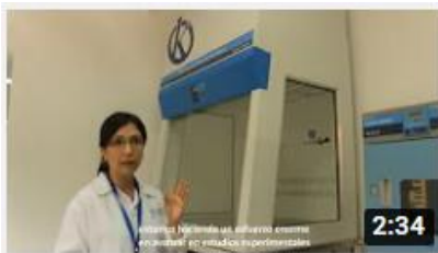
Kalstein France - Jacinto Convit Foundation / Alliances