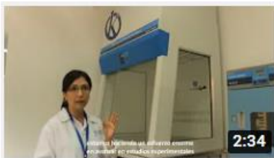
Kalstein France - Jacinto Convit Foundation / Allianc...