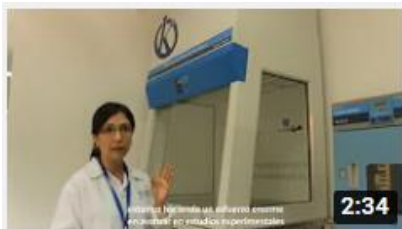
Kalstein France - Jacinto Convit Foundation / Alliances